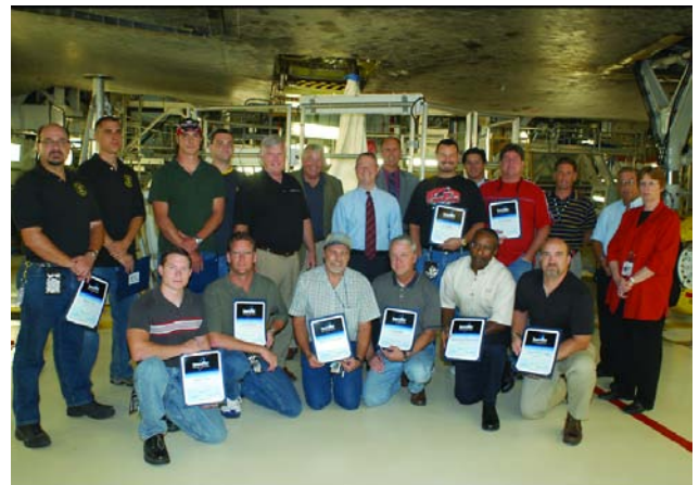
United Space Alliance recently honored SpaceTEC Certified Aerospace Technicians at a ceremony held in the Orbiter Processing Facility under the orbiter Atlantis.