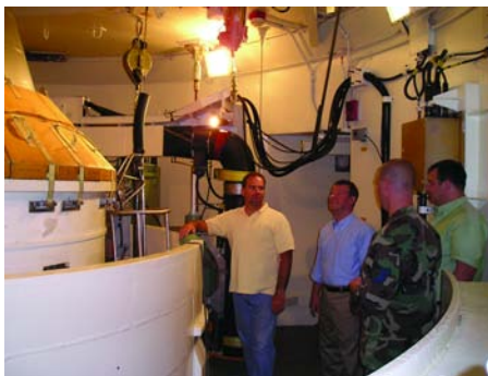
SpaceTEC and Air Force personnel inside a missile launch silo in Wyoming.