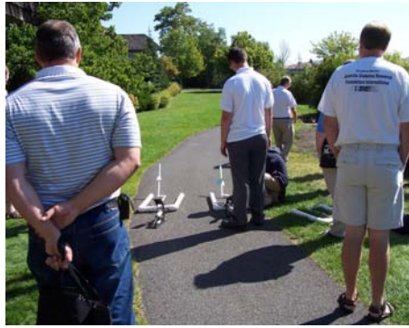
High school career and technical education teachers launching paper rockets during the Edmonds Community College rocket workshop on August 9, 2006, during the Washington Association of Career and Technical Education Conference.

Twenty-five participants made paper rockets and launched them adjacent to the hotel on to a small grass strip next to the Snake River. All the rockets flew successfully with the longest flight of 250 feet