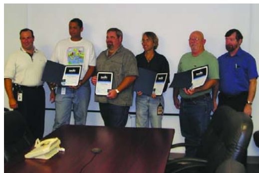
Technicians employed by SPACEHAB, Inc. receive their SpaceTEC certifications in a ceremony recognizing their achievement.