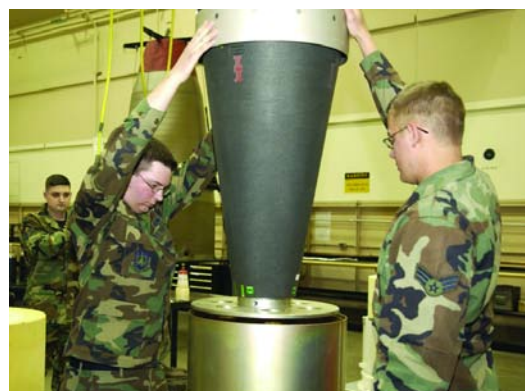
Air Force technicians work on flight hardware in a controlled shop area.