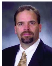
JR Breeding Community College of the Air Force

Examiners from seven different locations participated in half day workshops that incorporated both lecture and hands on training. Training sessions were conducted at Brevard Community College, Vandenberg Air Force Base (Allan Hancock College) and Antelope Valley College. The new examiners will represent Antelope Valley College, Vandenberg Air Force Base, Brevard Community College, Community College of the Air Force, Cuyahoga Community College, Embry Riddle Aeronautical University and NASA Dryden.