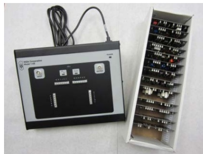
Figure 1-NIDA 110E trainer w/testing cards

SpaceTEC Partners Inc. has purchased new equipment for the Basic Electricity and Electronics ( BEE ) Certifications. Under the CertTEC® brand the new testing stations will allow us to offer a performance-based certification in BEE for AC, DC, Analog and Digital. Along with the new testing stations an examinee will utilize a multimeter, function generator and oscilloscope.