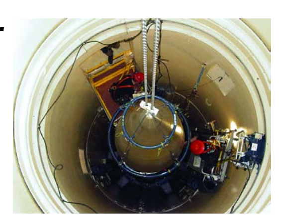
Technicians work on a missile suspended inside a launch silo.

Space Development to use the Falcon 9 launch vehicle that could fly as either a crew transport or cargo vehicle (pressurized and unpressurized). Falcon 9 will be recoverable, but is not planned to be reusable.