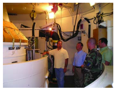
SpaceTEC and Air Force personnel inside a missile launch silo in Wyoming.

The Air Force partnership with SpaceTEC offers thousands of aerospace and aviation technicians the opportunity to pursue