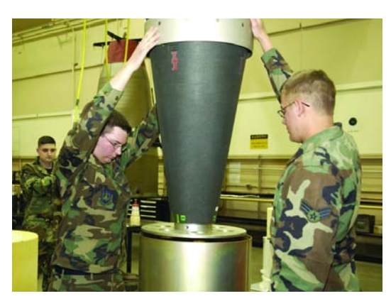
Air Force technicians work on flight hardware in a controlled shop area.

SpaceX is partnering with SPACEHAB, ARES Corp., Odyssey Space Research (Houston), and Paragon